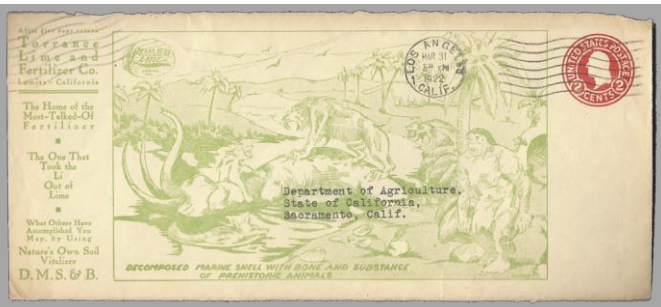
Figure 1. Prepaid cover sent by Torrance Lime and Fertilizer Company, featuring what may be the first dinosaur on a postal item (see close up above by postmark). Only example known to exist.